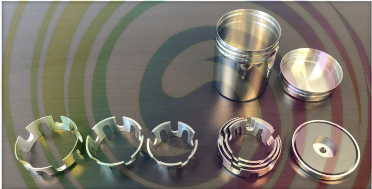
Pulverising ring set (shown with 2 sets of 3 rings – Separate and Nested)